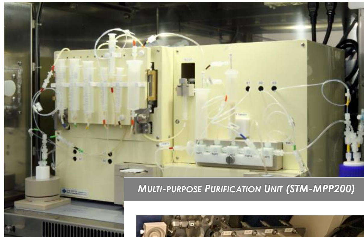
MULTI-PURPOSE PURIFICATION UNIT (STM-MPP200)